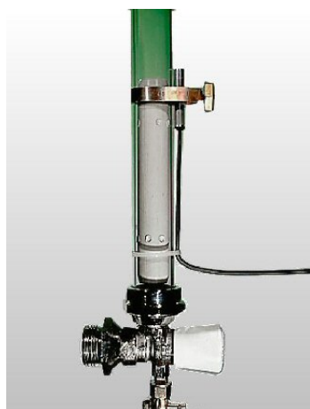
MRK 10 P 34 Monostable Reed contact mounted on glass sight level indicator GNR5