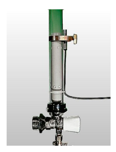
MRK 10 P 34 Monostable Reed contact mounted on glass sight level indicator GNR5